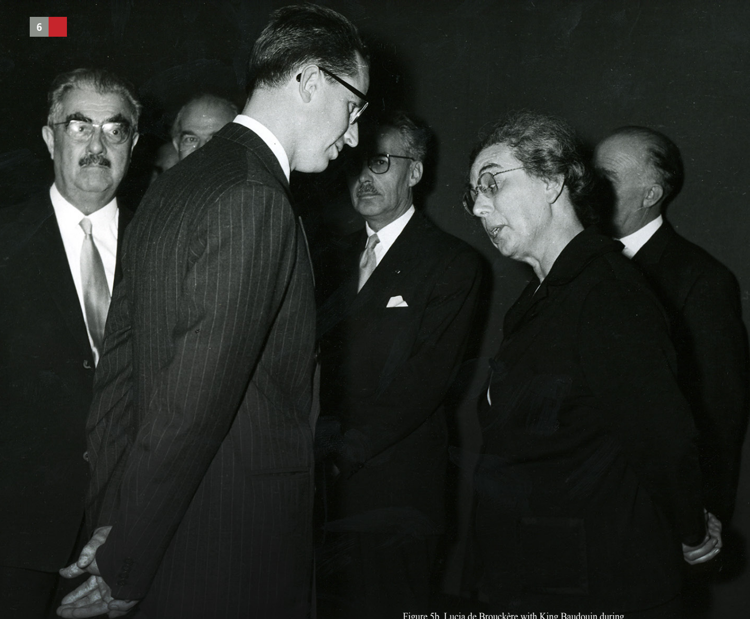
Figure 5b. Lucia de Brouckère with King Baudouin during the 12 th Solvay Council on Chemistry, 5–10 November 1962.